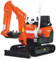
Micro Excavator 0.8T Min Width 0.75m Max Dig Depth 1.7m Kubota KX008