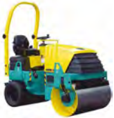
Single Drum Pedestrian (Diesel)