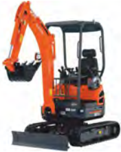
Mini Excavator 1.5T/1.7T Min Width 1.0m Max Dig Depth 2.25m Kubota KX015 Kubota U17