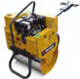
Single Drum Pedestrian (Petrol)