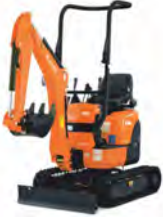
Mini Excavator 1T Min Width 0.76m Max Dig Depth 1.8m Kubota U10