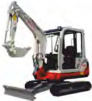
Mini Excavator 2T Min Width 1m Max Dig Depth 2.27m Bobcat E19