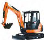
Mini Excavator 2.5T/3.0T Min Width 1.5m Max Dig Depth 2.87m Kubota U27 Kubota KX71 - height 2.43m