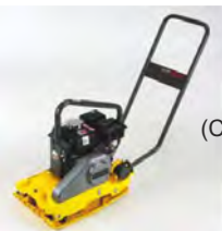
Compactor Plate (Come in two sizes 12" and 18")